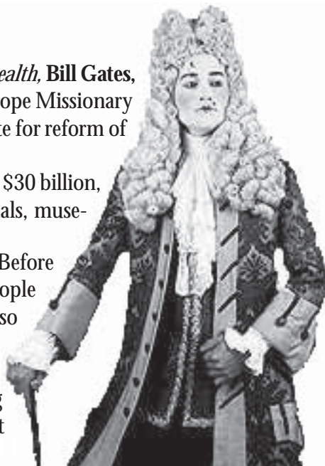
Mr. Snooty Royal Wannabe says, "I don't see why those dreadful peasants want ME to pay taxes!"

Take action! Call Senator Murray (206-224-2621) or Senator Cantwell (206-220-6400) and ask them to vote against the repeal of the estate tax. Call 1 (800) 562-6000 to tell Gov. Locke and legislators to save Washington's state estate tax. Let them know you believe it's fair and appropriate for large estates to contribute back to our society.