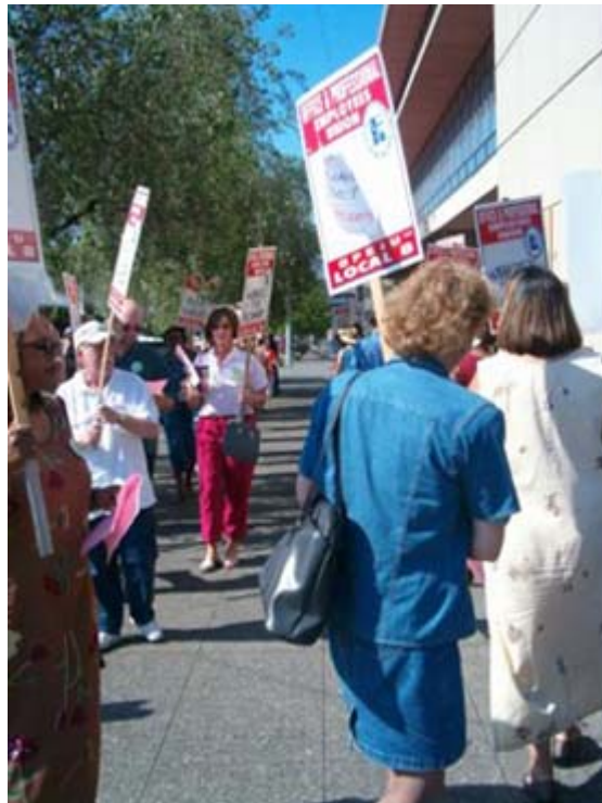
At right: Looks like all that marching in the hot sun paid off!