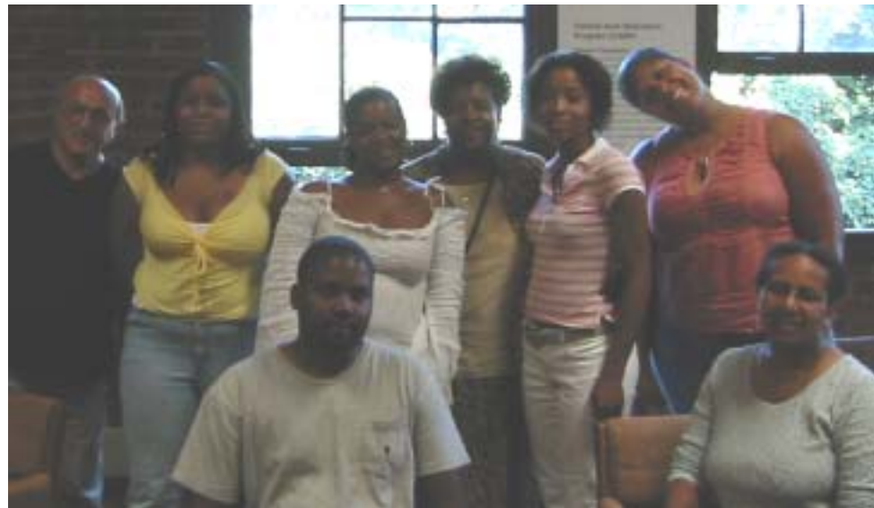
CAMP workers celebrate after their first contract vote.