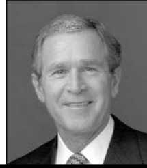
GEORGE W. BUSH