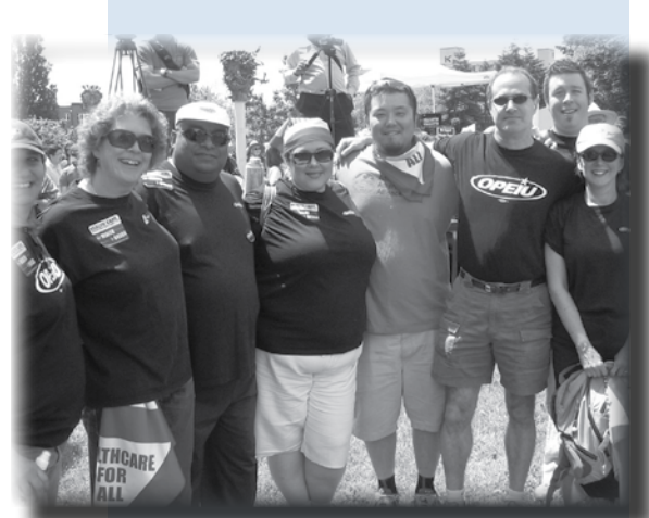
Local 8 Members March in Support of Health Care for All on May 30.