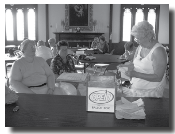
Election Committee Counting Ballots at the Final Vote in Aberdeen July 28, 2009

As reported in previous newsletters and elsewhere, Local 8 has expanded Membership Meetings and the Executive Board to be more inclusive and responsive to members throughout the State. The new model will begin in 2010 with our first Membership Assembly on Saturday, January 23. Watch for details in late November. Members can also get more information on the new bylaws changes and structure at www.opeiu8.org .