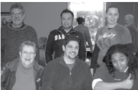
SeaMar Leaders at the Dec. 5 Leadership Training