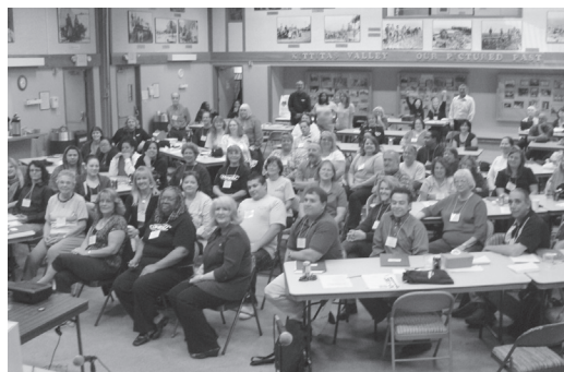
Local 8's Membership Assembly in Ellensburg, Sept. 25. Story Inside.

Contract negotiations begin soon and we look forward to welcoming our newest members to OPEIU.