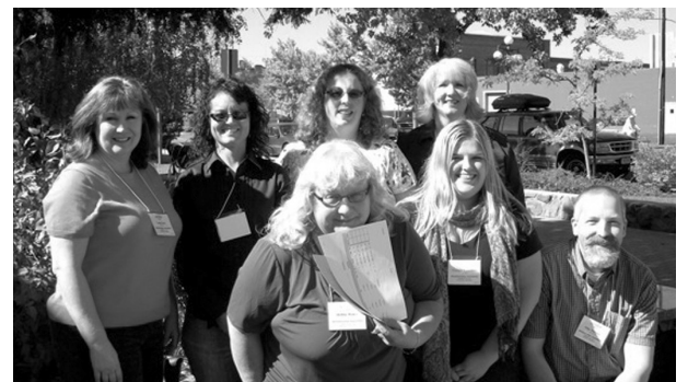
Members of the Political Action Committee.