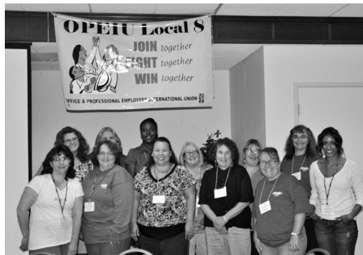
Members of the Shop Steward and Education Committee