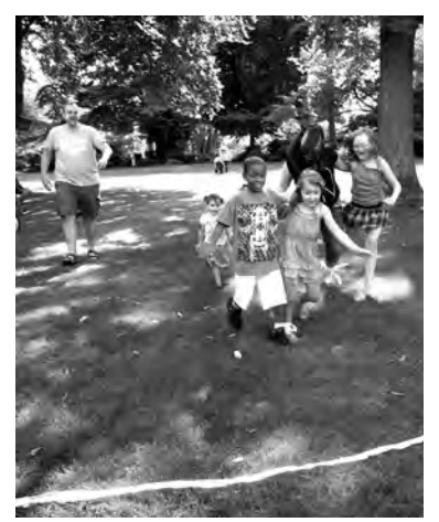
Three Legged Race

Members from Providence Hospital, Sea Mar, Visiting Nurse Service, Carpenter's Trust and other work places enjoyed a sunny day of family fun last month. Check out more photos of the Local 8 Unity Barbeque on line at www.opeiu8.org.