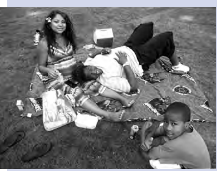
A Day for the Whole Family