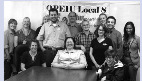
The Shop Steward Committee after completing filming of the Weingarten training video.

Watch for the debut at the next Assembly!