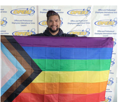
RESJ decided on a potluck because we are representative of diversity and democracy. We are all about celebrating community and relying on the different contributions of all involved. This event created the space for us to socialize, share information, try different foods, meet new members, and really cultivate a culture of support and belonging.

On Saturday, October 9th, OPEIU LOCAL 8's Race, Equity and Social Justice (RESJ) Committee held a Unity Potluck in Tacoma. After being isolated from each other for so long during the pandemic and only "seeing" each other via virtual platforms, it felt great to be able to safely gather outside (with masks and hand sanitizer a-plenty!). There was a lot of food, great conversation, a social justice themed book exchange, raffle drawings with union giveaways, music, yard games, art projects, and most importantly the opportunity for members to meet and mingle.