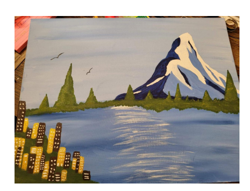
Painting #1 Saturday, June 11th, 2:30-5:30PM